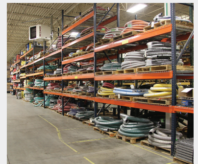
Over 115,000 Square Foot Warehouse and Assembly/Fabrication Facility