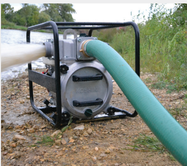
Industry Leader in Contractor & Rental Market: Hose, Hose Assemblies and Accessories