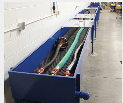
Complete Hose Testing and Certification On-site and In-house Hose Fabrication

Corporate 21365 Gateway Court Brookfield, WI 53045 Ph: 262-784-3340 Fax: 262-784-9749 sales@andersonprocess.com