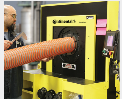
Cutting Edge Technology, Large Diameter Hose Crimping Capabilities up to 10"