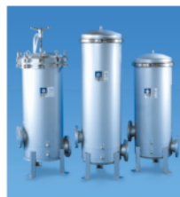
High Flow Multi Cartridge Housings