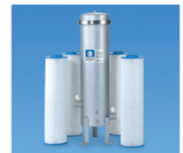
Jumbo Cartridge Housings