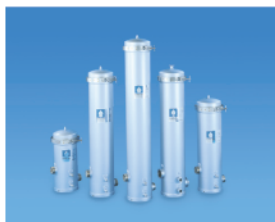
Multi Cartridge Housings