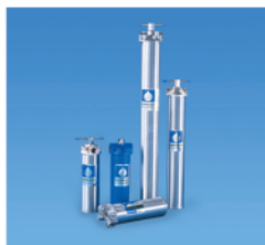
#3 and #4 size Housings

Shelco® manufactures a full line of filter housings. From our rugged single element housings to our heavy-duty multi-rounds and bag housings, we have the right filter for your requirement. Shelco® is the perfect choice for your problem solutions.