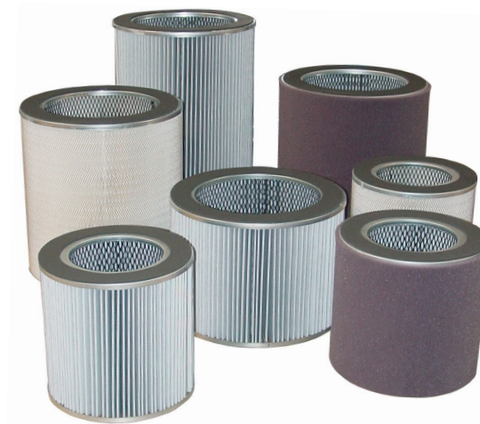
Compact & Large Elements with Metal Endcaps