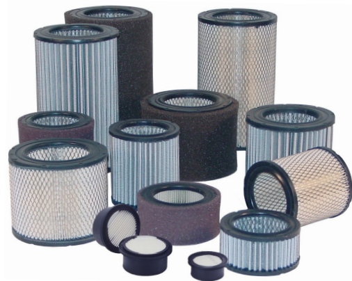
Small Elements with Molded Endcaps