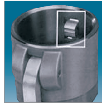
Detent position of Twin-Kam™ arms help prevent unintentional arm release.