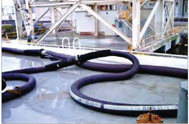
Hose in service: Note the gradual bend achieved off of the horizontal connections