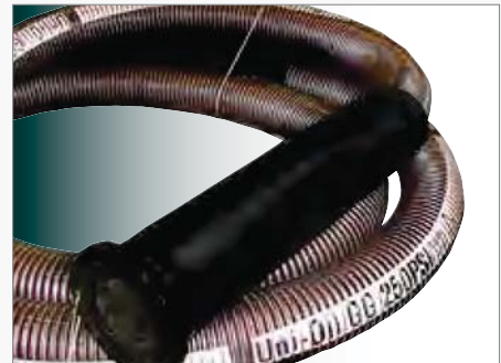
Hose coiled and placed on pallet; ready for shipment