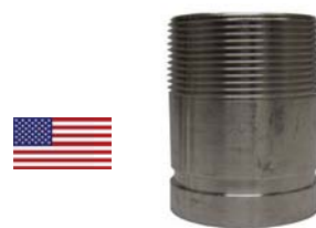
Male NPT by Groove-End