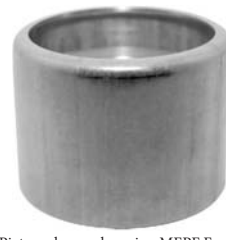
Picture shown above is a MEFPS Ferrule Permtach Low Pressure