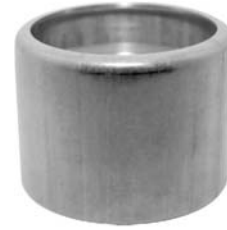
Picture shown above is a MEFP Ferrule Permtach Low-Pressure