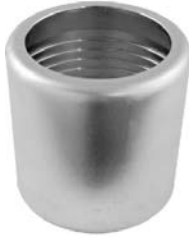
Picture shown above is a MEFSS/MEFPS Ferrule

All items on this page are domestic, made in the U.S.A. LGV has capabilities of customizing product to the length required or thicker material. The fourth column is to be used with low pressure "Permtach" fittings. Please call for more questions.