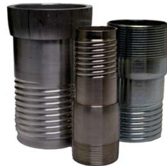
Composite Fittings (Must provide dimensions needed)