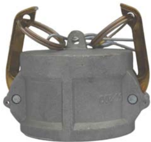
Type DC - Aluminum