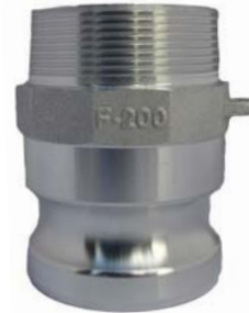
Type F - Aluminum