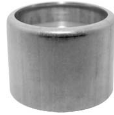
Picture shown above is a MEPF Ferrule Permtach Low Pressure