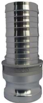
Type E - Aluminum