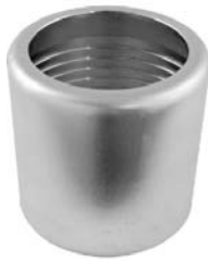
Picture shown above is a MEFSS/MEFPS Ferrule

All items on this page are domestic, made in the U.S.A. LGV has capabilities of customizing product to the length required or thicker material. The fourth column is to be used with low pressure "Permtach" fittings. Please call for more questions.