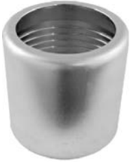
Picture shown above is a MEFSS/MEFPS Ferrule

All items on this page are domestic, made in the U.S.A. LGV has capabilities of customizing product to the length required or thicker material. The fourth column is to be used with low pressure "Permtach" fittings. Please call for more questions.