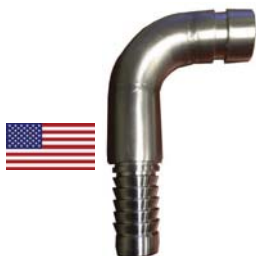
Groove-End 90 Elbow

Let us bring your design to life with our custom capabilities!