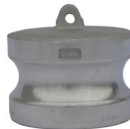
Type DP - Aluminum