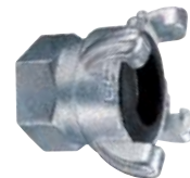
Zinc Plated Four Lug Female Threaded Coupling (NPT Threads)