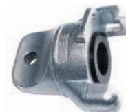
Zinc Plated Blank End