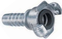
Zinc Plated Two Lug Hose Coupling