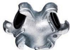
Zinc Plated Three Way Connector