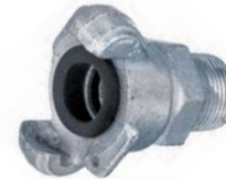
Zinc Plated Two Lug Male Threaded Coupling (NPT Threads)