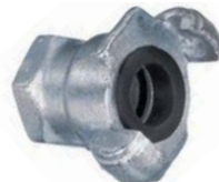
Zinc Plated Two Lug Female Threaded Coupling (NPT Threads)