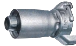
Zinc Plated Two Lug Hose Coupling with Crimp Ferrule