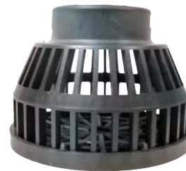
Polypropylene Strainer (NPSM Threads)