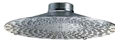
Bottom Hole Zinc Plated Steel Strainer (NPSM Threads)