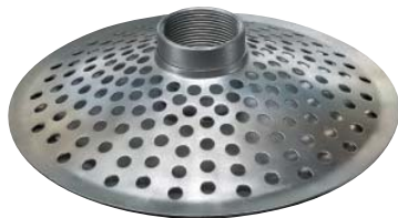
Top Hole Zinc Plated Steel Strainer (NPSM Threads)