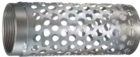
Long Round Hole Zinc Plated Steel Strainer (NPSM Threads)