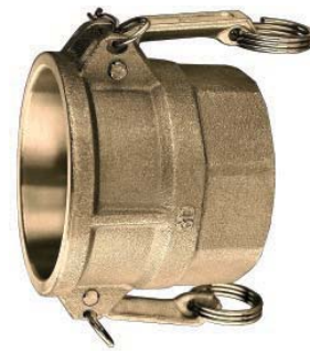
Brass Part D Female Coupler x Female NPT