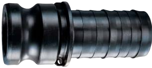
Polypropylene Part E Male Adapter x Hose Shank