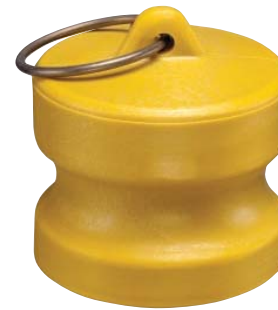
Nylon Part DP Dust Plug