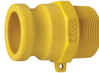
Nylon Part F Male Coupler x Male NPT