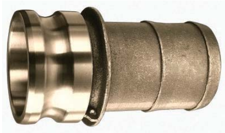
Brass Part E Male Adapter x Hose Shank