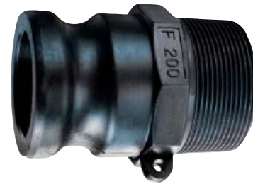
Polypropylene Part F Male Adapter x Male NPT