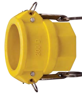
Nylon Part D Female Coupler x Female NPT