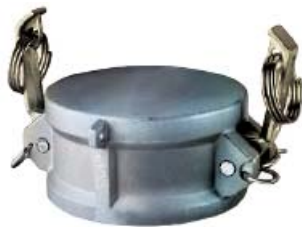
Aluminum Part DC Dust Cap