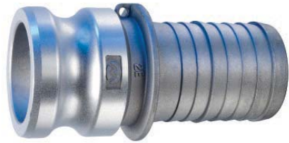
Aluminum Part E Male Adapter x Hose Shank