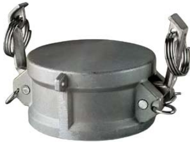
316 Stainless Part DC Dust Cap