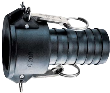
Polypropylene Part C Female Coupler x Hose Shank