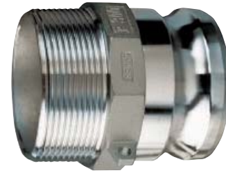
316 Stainless Part F Male Adapter x Male NPT