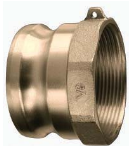
Brass Part A Male Adapter x Female NPT