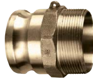
Brass Part F Male Adapter x Male NPT