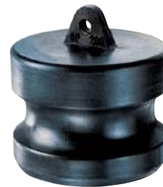
Polypropylene Part DP Dust Plug