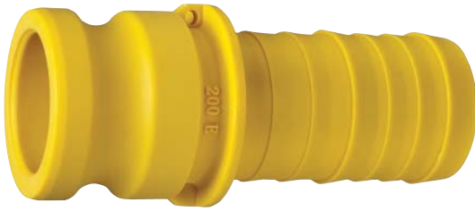
Nylon Part E Male Adapter x Hose Shank