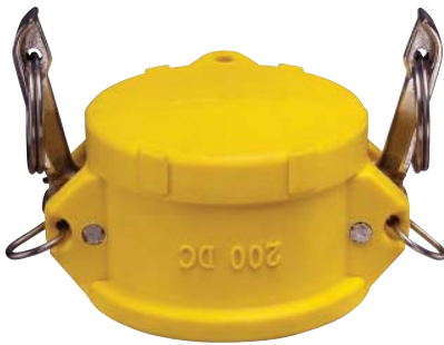
Nylon Part DC Dust Cap