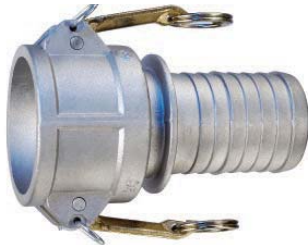
Aluminum Part C Female Coupler x Hose Shank