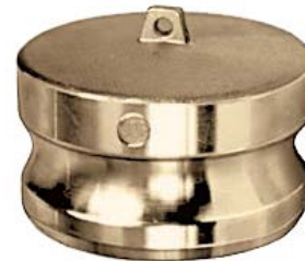
Brass Part DP Dust Plug