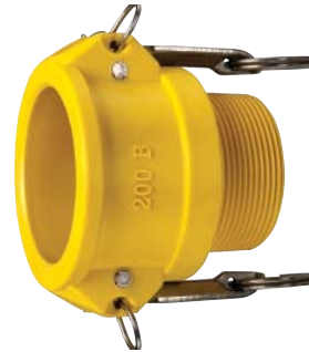
Nylon Part B Female Coupler x Male NPT