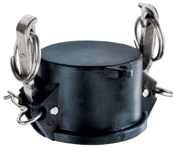
Polypropylene Part DC Dust Cap