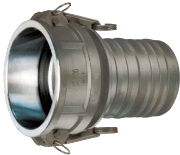
316 Stainless Part C Female Coupler x Hose Shank