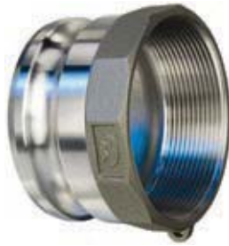
304 Stainless Part A Male Adapter x Female NPT