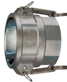
316 Stainless Part D Female Coupler x Female NPT