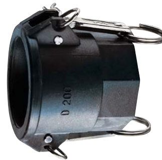
Polypropylene Part D Female Coupler x Female NPT