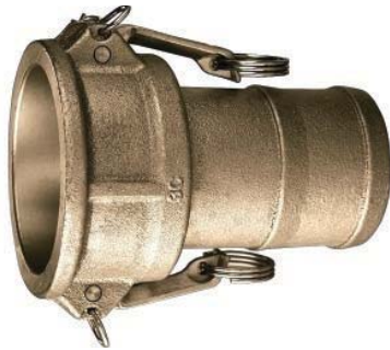
Brass Part C Female Coupler x Hose Shank