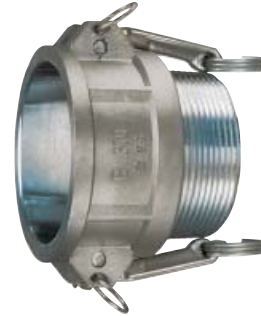
316 Stainless Part B Female Coupler x Male NPT