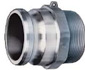
Aluminum Part F Male Adapter x Male NPT