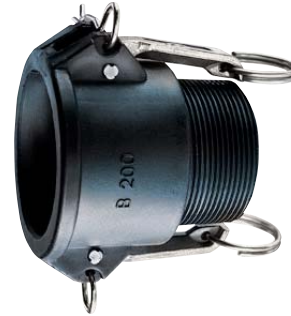
Polypropylene Part B Female Coupler x Male NPT