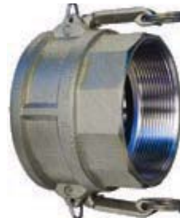
304 Stainless Part D Female Coupler x Female NPT