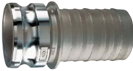
316 Stainless Part E Male Adapter x Hose Shank