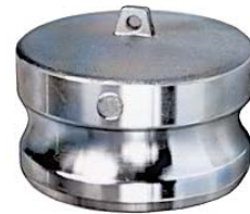
Aluminum Part DP Dust Plug