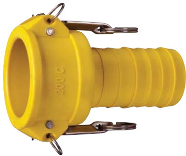
Nylon Part C Female Coupler x Hose Shank