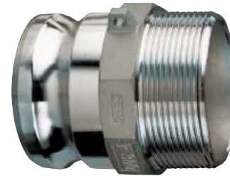
304 Stainless Part F Male Adapter x Male NPT