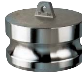
316 Stainless Part DP Dust Plug