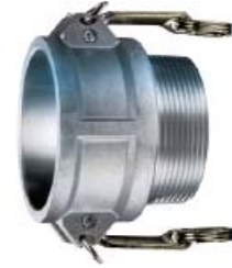
Aluminum Part B Female Coupler x Male NPT