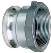
Aluminum Part A Male Adapter x Female NPT