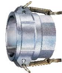
Aluminum Part D Female Coupler x Female NPT