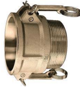
Brass Part B Female Coupler x Male NPT