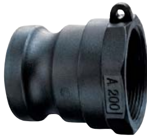
Polypropylene Part A Male Adapter x Female NPT