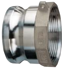
316 Stainless Part A Male Adapter x Female NPT