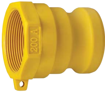
Nylon Part A Male Adapter x Female NPT