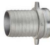
Aluminum Shank Male End (NST Threads)