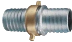
Aluminum Shank with Brass Swivel Nut Complete Set (NPSM Threads)