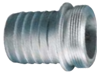
Aluminum Shank Male (NPSM Threads)