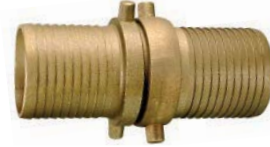
Brass Shank with Brass Swivel Nut Complete Set (NPSM Threads)