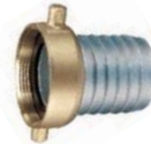
Aluminum Shank with Brass Swivel Nut Female (NPSM Threads)