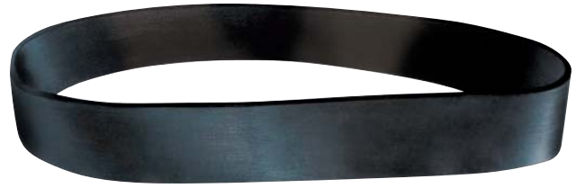
BUNA-N Shank Band for EZ-Seal™ Leak Resistant Couplings

Note: Sold in standard carton quantity only.