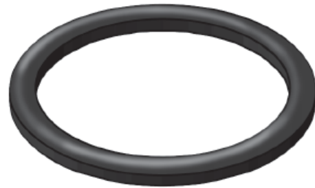
BUNA-N Gasket for API Petroleum Couplings

Temperature Rating -40°F (-40°C) to 250°F (+121°C)