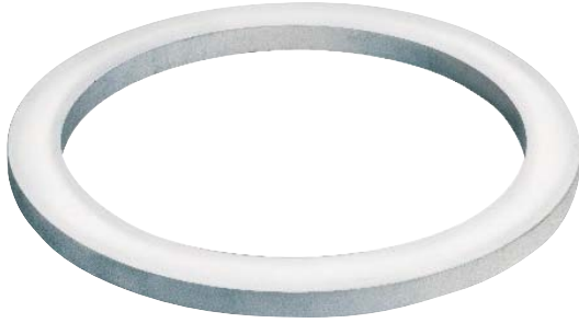
White Neoprene (FDA) Gasket for Quick-Acting Couplings

Temperature Rating -45°F (-43°C) to 250°F (+121°C)