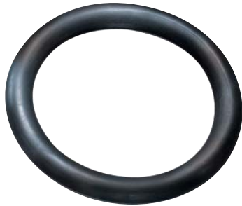
EPDM Gasket for Irri-Loc® Couplings

Note: Sold in standard carton quantity only.