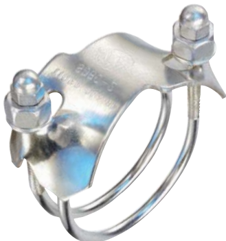
Zinc Plated Carbon Steel Spiral Double Bolt Clamp (For Clockwise Spiral Hoses) Designed for Tigerflex™ Tiger-TR1™ Hoses