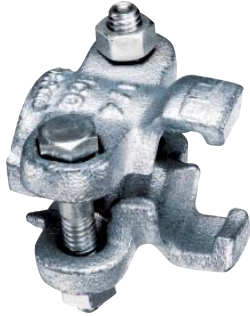
2 Bolt Hose Clamp

(Recommended for use with Universal Couplings)