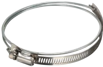
Bridge Clamp for Ducting Hoses 300 Stainless Worm Gear Band (For Counterclockwise Spiral Hoses)