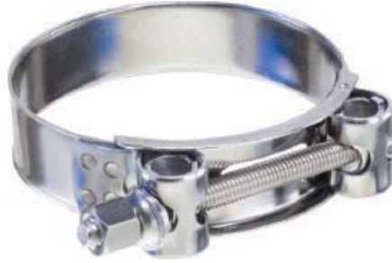
Heavy Duty T-Bolt Clamp 304 Stainless Steel Band, Bolt and Nut