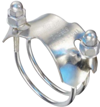
Zinc Plated Carbon Steel Spiral Double Bolt Clamp (For Counterclockwise Spiral Hoses) Designed for Tigerflex™ PVC Suction Hoses