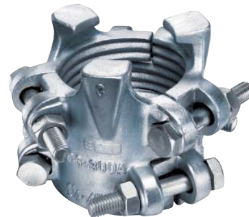
6 Bolt Hose Clamp

(Recommended for use with Ground Joint Couplings)