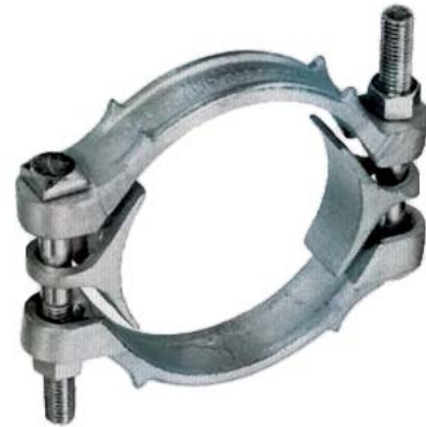
Zinc Plated Ductile Iron Double Bolt Hose Clamp