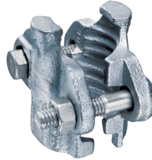
2 Bolt Hose Clamp

(Recommended for use with Ground Joint Couplings)