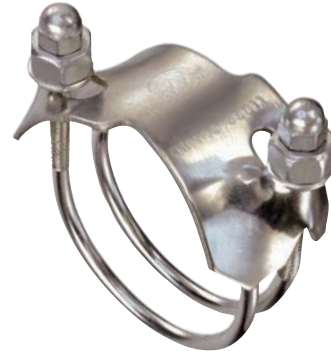
Stainless Steel 304 Spiral Double Bolt Clamp (For Counterclockwise Spiral Hoses) Designed for Tigerflex™ PVC Suction Hoses