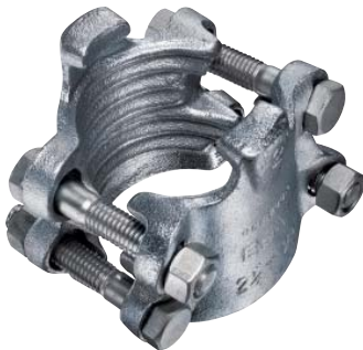
4 Bolt Hose Clamp

(Recommended for use with Ground Joint Couplings)