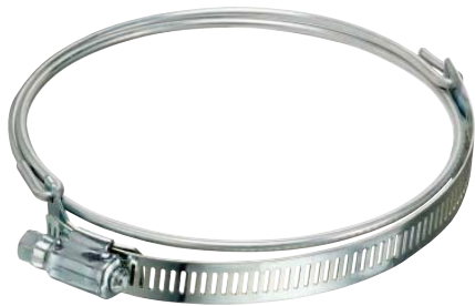
Bridge Clamp for Ducting Hoses 300 Stainless Worm Gear Band (For Clockwise Spiral Hoses)