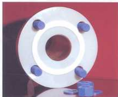
STANDARD "LTC" GASKET

See Reverse Side for Application Details