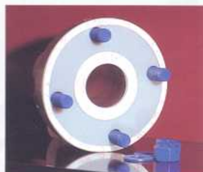
"LTC-NR" NON-ROTATIONAL GASKET

See Reverse Side for Application Details