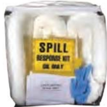
oil spill kit