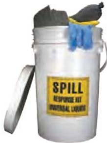
universal spill kit