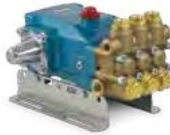
5CP3120 Solid Shaft Pump