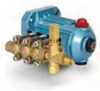
2SF10ES3 Hollow Shaft Pump