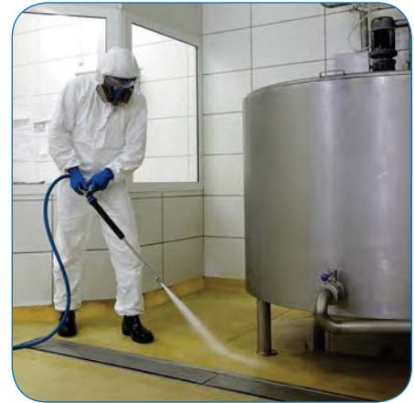
Cat Pumps high-pressure cleaning systems are used to improve cleaning results in less time and maximize water and energy savings.

Contact Cat Pumps to learn more about how we can help you reduce energy and maintenance costs while keeping your facility clean.