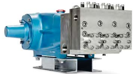
Model 6831 40 gpm (152 lpm), 2300 psi (158 bar)

“The Cat Pumps pump and system reduced the energy costs from $69.5K to $20.5K, and maintenance costs from $46.1K per year to $4.4K. These are 70% energy and 90% maintenance savings respectively – per year.”