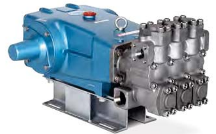
Model 6762 60 gpm (227 lpm), 1200 psi (83 bar)